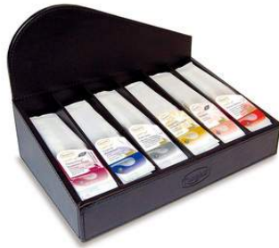
91732 Banquet display for 6 boxes LeafCup® artificial leather, black W/H/D (cm): 28/20/19 1 pcs Price per piece: 21,40 €