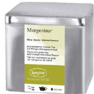
18788 Buffet tea tin silver, for 250 g 1 pcs Price per piece: 1,60 €