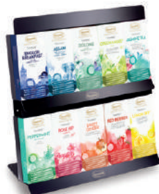
91650 Bar display base for 5 boxes Teavelope® stainless steel, black W/H/D (cm): 40,5/23/18,3 1 pcs Price per piece: 32,00 €