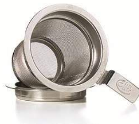
12 Strainer size L, stainless steel Ø/H (cm): 7/9 for Art.-No. 505 1 pcs Price per SU: 4,75 €