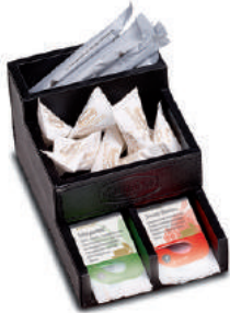
91733 In-room display for 2 var. LeafCup® artificial leather, black W/H/D (cm): 10/9/16,8 1 pcs Price per piece: 13,00 €