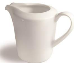
550 Milk jug porcelain, 0,15 l BHS Tabletop 6 pcs Price per piece: 0,00 €