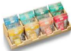
8115 In-room display for 100%/Teavelope® sachets bamboo W/H/D (cm): 36/14/8,5 1 pcs Price per piece: 11,00 €