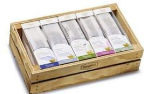
91468 Farmers crate for 5 boxes Tea-Caddy®/Cup-Caddy®, 6 boxes LeafCup® finnish spruce W/H/D (cm): 33/9/19 1 pcs Price per piece: 30,00 €