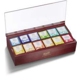
91264 Presentation box for 12 var. Teavelope® wooden, mahogany, acrylic lid W/H/D (cm): 44,8/12,2/19,5 1 pcs Price per piece: 77,50 €