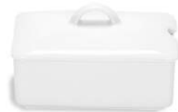
545 Sugar bowl porcelain BHS Tabletop 6 pcs Price per piece: 0,00 €