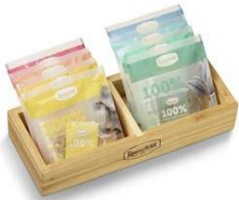
8112 In-room display for 100%/Teavelope® sachets bamboo W/H/D (cm): 20/8/3,9 1 pcs Price per piece: 0,00 €