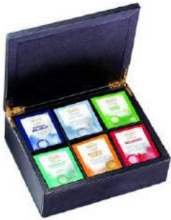
91700 Presentation box for 6 var. Teavelope® artificial leather, black W/H/D (cm): 22/8/17,8 1 pcs Price per piece: 21,90 €