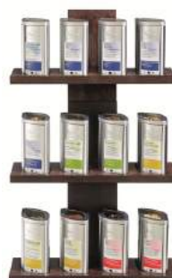
91161 TeaLeaf display module for 4 additional TeaLeaf tins wooden, stained wenge, without tins W/H/D (cm): 42/66,5/28,5 add-on unit for Art.-No. 91160 1 pcs Price per piece: 63,50 €