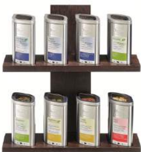
91160 TeaLeaf display base for 8 TeaLeaf tins wooden, stained wenge, without tins W/H/D (cm): 42/42/28,5 1 pcs Price per piece: 113,00 €