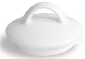
570 Replacement lid porcelain for Art.-No. 530/535 BHS Tabletop 6 pcs Price per piece: 2,30 €