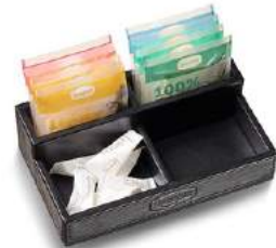
91730 In-room display for 100%/Teavelope® sachets artificial leather, black W/H/D (cm): 19/5,3/11,5 1 pcs Price per piece: 11,00 €