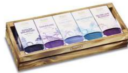
91467 Farmers crate for 5 boxes Teavelope® finnish spruce W/H/D (cm): 35,5/8/18 1 pcs Price per piece: 28,00 €