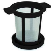
9061 Strainer plastic, black Ø/H (cm): 6-9,7/8,1 (with cover) 1 pcs Price per SU: 2,60 €