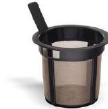
400 Strainer plastic, black, stainless steel filter mesh 1 pcs Price per SU: 2,90 €