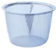
8961 Strainer stainless steel for Art.-No. 8960 1 pcs Price per SU: 0,90 €