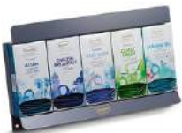
90421 Bar display module for additional 5 boxes Teavelope® metal, grey W/H/D (cm): 40,5/23/18,3 add-on for Art.-No. 90422 1 pcs Price per piece: 41,50 €