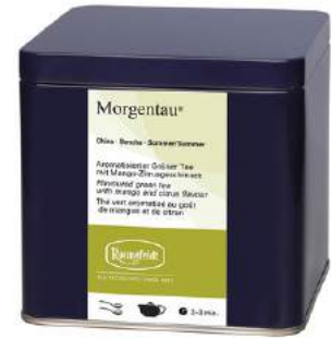
18785 Buffet tea tin blue, for 250 g 1 pcs Price per piece: 1,60 €