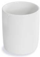
565 Strainer cup porcelain BHS Tabletop 6 pcs Price per piece: 2,20 €