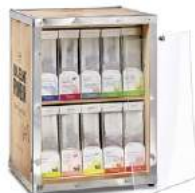
91472 Hygiene protection for Art.-No. 91471 Plexiglas® W/H/D (cm): 27,5/36/0,3 1 pcs Price per piece: 15,70 €