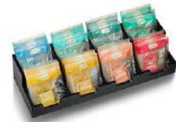
8116 In-room display for 100%/Teavelope® sachets bamboo, black W/H/D (cm): 36/14/8,5 1 pcs Price per piece: 11,00 €