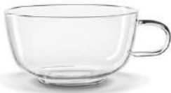
9114 Cup glass, 0,3 l 6 pcs Price per piece: 0,00 €