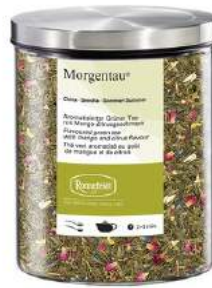
26 Glass jar for 500 ml Ø/H (cm): 10/12 1 pcs Price per piece: 4,80 €