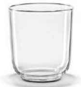
9103 Strainer cup glass 6 pcs Price per piece: 2,60 €