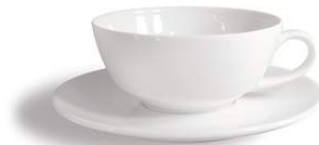
560 Cup with saucer porcelain, 0,2 l BHS Tabletop 6 Stück Price per piece: 6,90 €