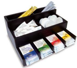
91731 In-room display for 4 var. LeafCup® artificial leather, black W/H/D (cm): 19/9/16,8 1 pcs Price per piece: 16,00 €