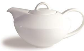
530 Teapot porcelain, 0,8 l BHS Tabletop 6 pcs Price per piece: 13,60 €