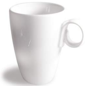
561 Mug porcelain, 0,32 l H (cm): 11,2 BHS Tabletop 6 pcs Price per piece: 7,30 €