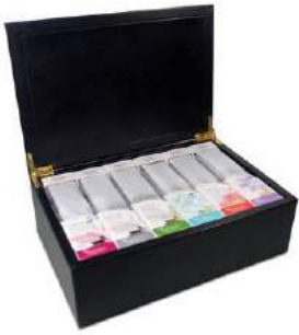
91735 Presentation box for 6 boxes LeafCup® artificial leather, black W/H/D (cm): 28,5/10,5/19,8 1 pcs Price per piece: 17,00 €