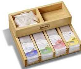
8101 In-room display for 4 var. LeafCup® bamboo W/H/D (cm): 20/7/16,5 1 pcs Price per piece: 5,70 €