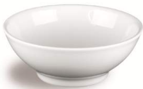
555 Dish for tea bags porcelain Ø (cm): 8 BHS Tabletop 12 pcs Price per piece: 1,20 €