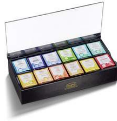
91741 Presentation box for 12 var. Teavelope® artificial leather, black, acrylic lid W/H/D (cm): 44,8/12,2/19,5 1 pcs Price per piece: 39,00 €