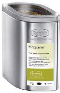
18420 TeaLeaf tin for 200 g W/H/D (cm): 7,2/14,6/12,5 1 pcs Price per piece: 4,70 €