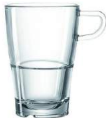
35 Cup without logo glass, 0,32 l for Art.-No. 33 6 pcs Price per piece: 0,00 €