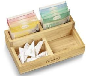
8100 In-room display for 100%/Teavelope® sachets bamboo W/H/D (cm): 19/5,3/11 1 pcs Price per piece: 0,00 €