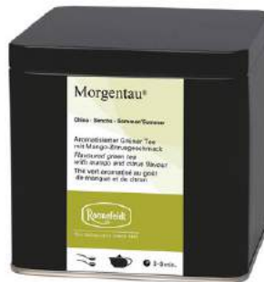
18787 Buffet tea tin black, for 250 g 1 pcs Price per piece: 1,60 €