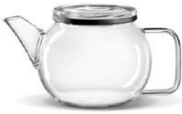
9100 Teapot glass, 0,4 l 6 pcs Price per piece: 8,20 €