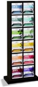
8118 Display for 12 boxes 100% bamboo, black W/H/D (cm): 25,2/60,8/13 1 pcs Price per piece: 82,90 €