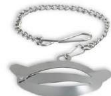
430 Teeli-Click stainless steel for Art.-No. 320/321/322 1 pcs Price per SU: 1,20 €