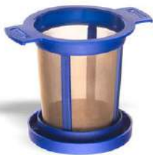
9062 Strainer plastic, blue Ø/H (cm): 6-9,7/8,1 (with cover) 1 pcs Price per SU: 5,00 €