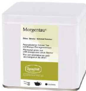
18786 Buffet tea tin white, for 250 g 1 pcs Price per piece: 1,60 €