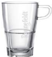
34 Cup with logo glass, 0,32 l for Art.-No. 33 12 pcs Price per piece: 3,10 €