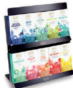
91651 Bar display module for 5 boxes Teavelope® stainless steel, black W/H/D (cm): 40,5/23/18,3 add-on for Art.-No. 91650 1 pcs Price per piece: 32,00 €