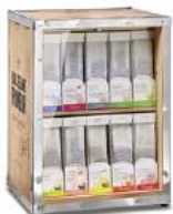
91471 Tea box for 10 boxes Tea-Caddy®/Cup-Caddy®/LeafCup® finnish spruce, without hygiene protection W/H/D (cm): 32/42,5/27 1 pcs Price per piece: 105,00 €