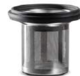
9110 Strainer stainless steel, wiper ring 6 pcs Price per SU: 3,70 €