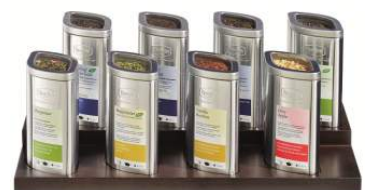
91162 TeaLeaf display for 8 TeaLeaf tins wooden, stained wenge, without tins W/H/D (cm): 47,5/4,5/27,2 Price per piece: 43,60 €