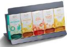
90422 Bar display base for 5 boxes Teavelope® metal, grey W/H/D (cm): 40,5/23/18,3 1 pcs Price per piece: 41,50 €