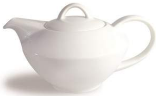
535 Teapot porcelain, 0,4 l BHS Tabletop 6 pcs Price per piece: 10,00 €